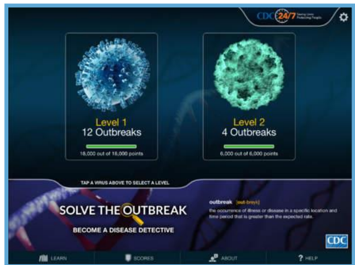
A screenshot of the "Solve the Outbreak" app from the CDC