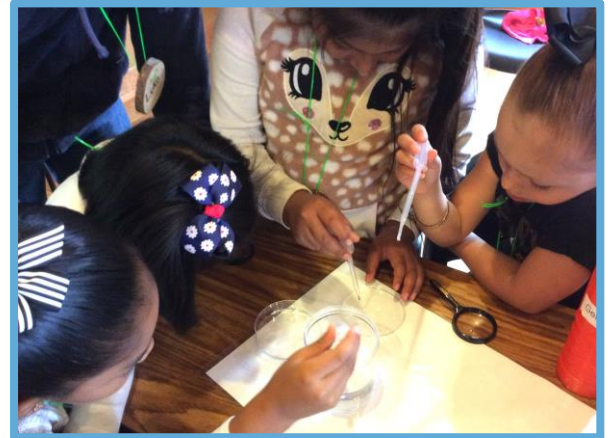
Students observe mosquito larvae.