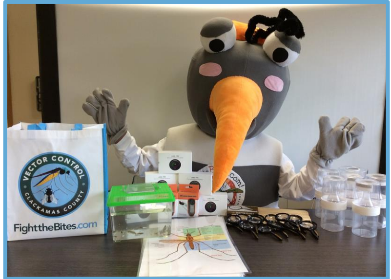
“Mosquitula” with a free Life Cycle Kit

Vectors is designed to engage students in enjoyable hands-on science inquiry about disease vectors and how to stay safe from them. Each lesson in the curriculum is aligned to the Next Generation Science Standards (NGSS) and Common Core State Standards, and care was taken to integrate art and other content areas, as well, in a wholistic approach. They can be adapted to meet the needs of learners in grades K–12 through the support of hands-on Life Cycle Kits including live mosquito larvae available free from Clackamas County Vector Control District (CCVCD). Numerous adaptations/ extensions are included in each lesson that can help you tailor them for your students.